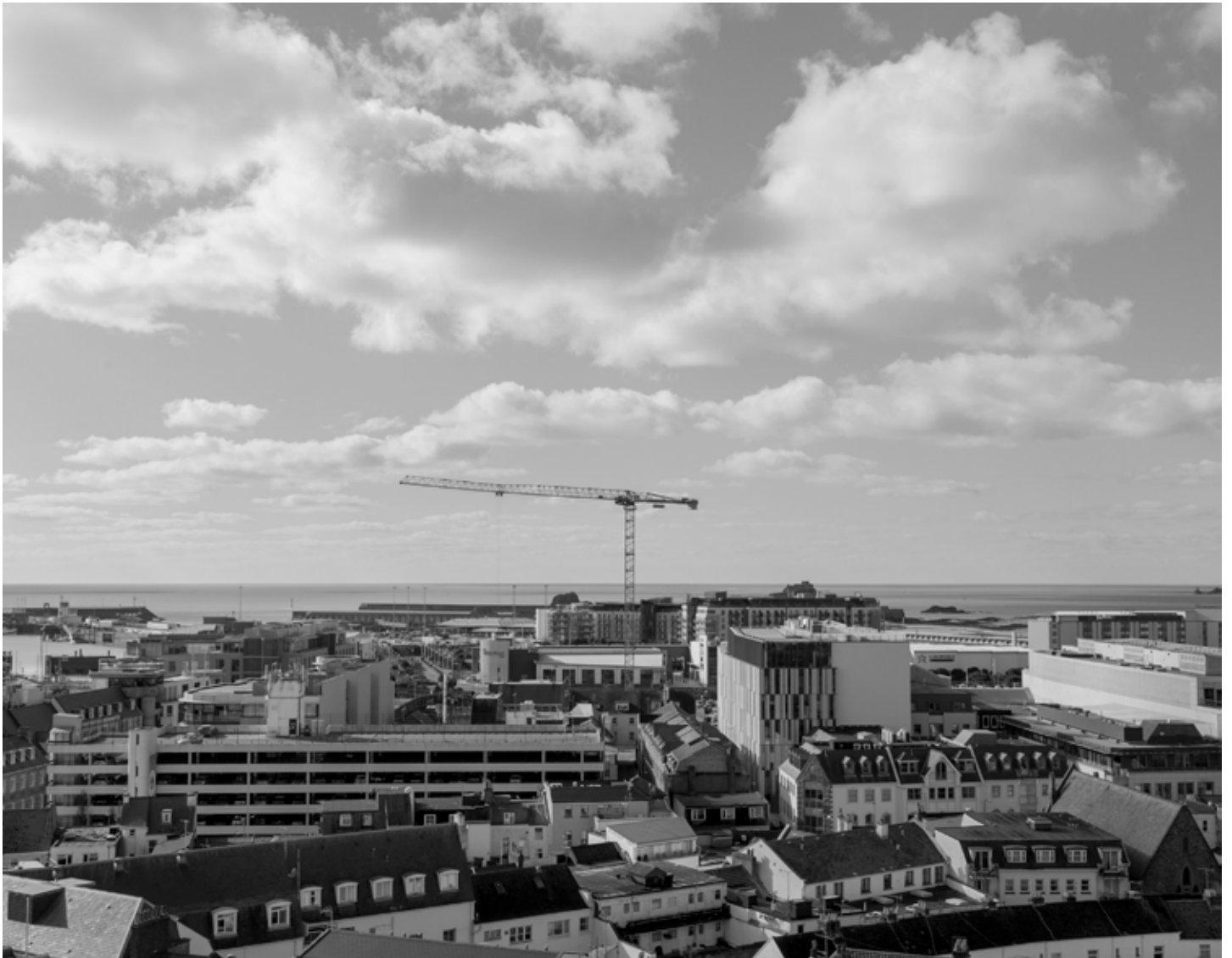
View towards the Waterfront and the construction of Jersey's International Finance Centre, St Helier, Jersey. 18 February 2016

The island of Jersey is one of the world's leading offshore International Finance Centres. In the second half of the twentieth century Jersey's economy has experienced a radical transformation from one based upon agriculture and tourism to a financial services industry which today commands over 50% of total economic activity. 100,000 people live in Jersey and in 2016, 13,000 islanders are employed within the finance sector. Jersey Finance, the organisation formed to promote the industry, stated that in 2015 the cross sector value of invested wealth exceeded £600 billion. Masterplan is a five year project (2016–2020) using photography, film and archival research to tell the story of Jersey's economic growth and development in the twentieth and twenty-first centuries. A visual record of contemporary Jersey is a question of what visual record there is of finance. And, what is a visual record of finance?