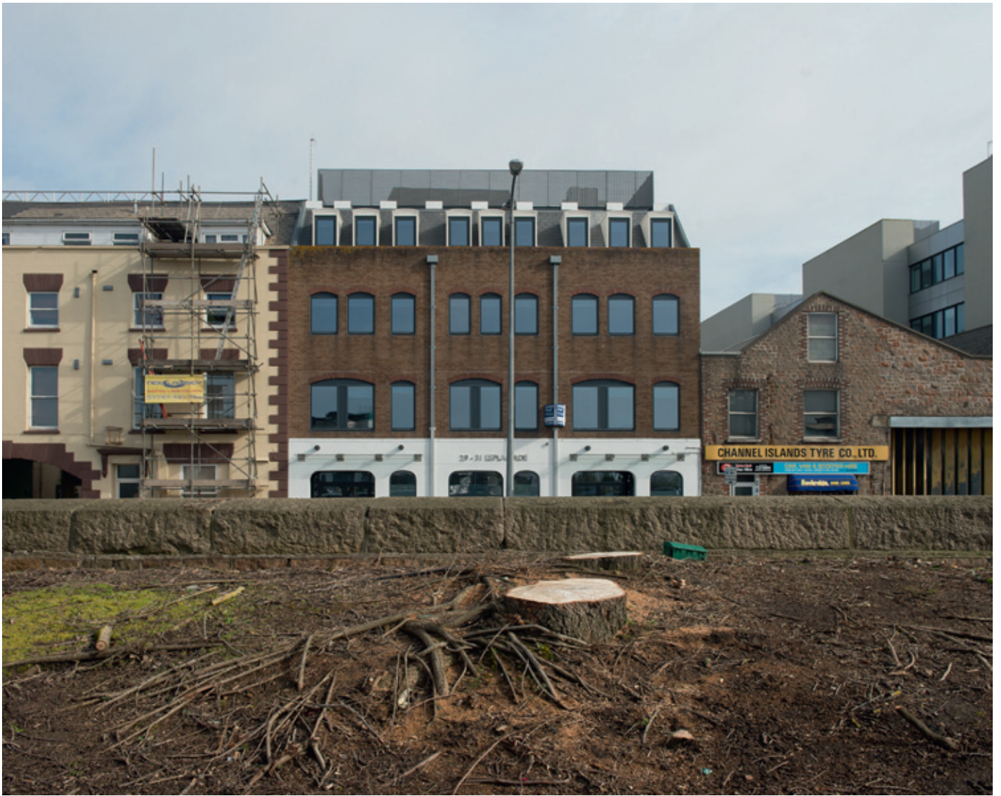
The Esplanade, site of the new Jersey International Finance Centre, St Helier, Jersey. 1 March 2015