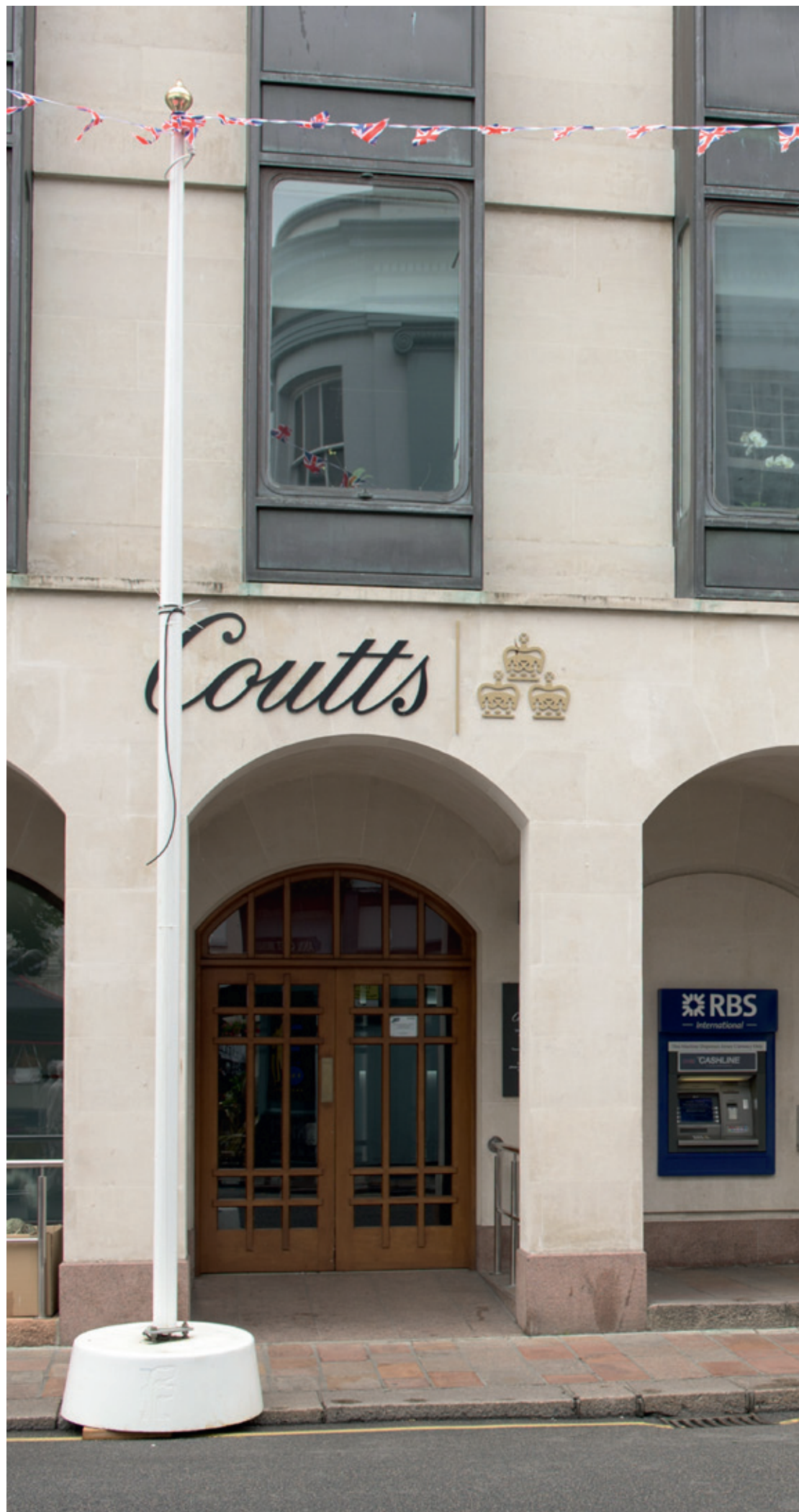
Coutts Jersey Office. Fête de St Helier, St Helier, Jersey. 19 July 2015