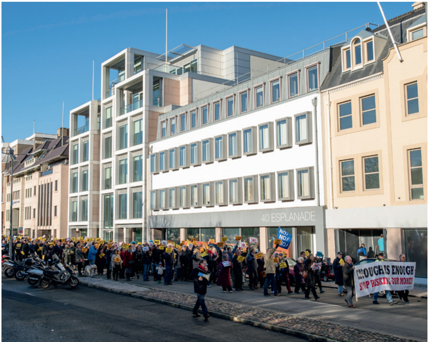
No Campaign Protest, The Esplanade, St Helier, Jersey, 26 November 2015