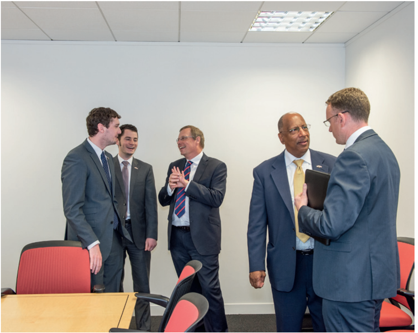
New Jersey States Assembly Members visiting Jersey Finance Ltd, St Helier, Jersey. 21 April 2015